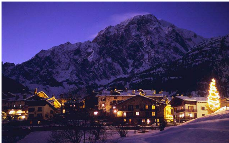
Courmayeur (above) and Chamonix are two gorgeous villages right at the base of Mt. Blanc, the highest mountain in Europe.

The town: Hands down, Courmayeur is one of the most beautiful ski villages in the world. From its quaint hotels to its amazing pedestrian shopping area, Courmayeur has it all. Truly, it is one of the most excellent Alpine villages in the world. Courmayeur was our second European adventure. We took almost 400 people there and everyone loved it. It is amazing.